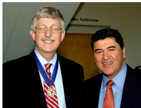
Dr. Francis Collins (l) shows his new medal, joined by NIH director Dr. Elias Zerhouni.

The medal, established in 1963, may be awarded by the President "to any person who has made an especially meritorious contribution to the security or national interests of the United States, or world peace, or cultural or other significant public or private endeavors."