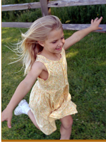
ABOVE • Many kids seem to grow out of ADHD; see Digest on p. 10.