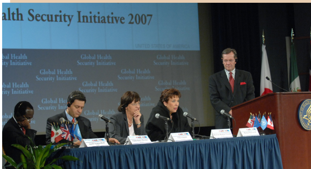
Above: On the final day of the Global Health Security Initiative meeting, HHS Secretary Mike Leavitt (standing) leads a press event in Natcher auditorium.

This was the first time the ministerial meeting was held in the U.S. and hosted by the HHS secretary. Past meetings have been held in Tokyo, Rome, Paris, Berlin, Mexico City, London and Ottawa. The final ministerial statement is available at www.ghsi.ca/english/statementWashington2007.asp .