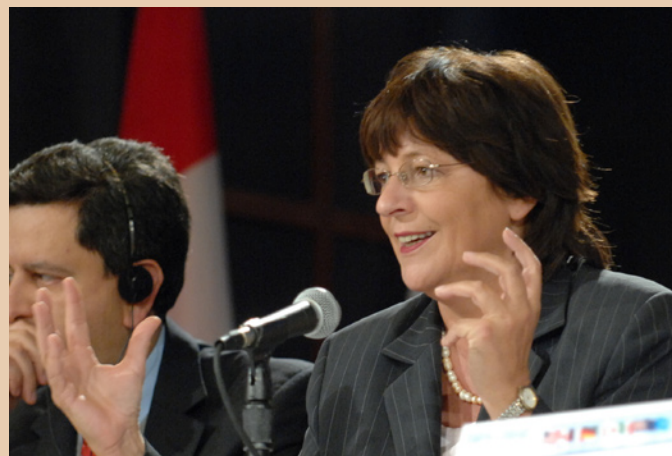
Offering replies at the press conference are United Kingdom Health Minister Dawn Primarolo (l) and Germany Health Minister Ulla Schmidt.