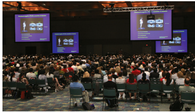
An NIDDK symposium on diabetes and obesity, held on June 26 at the American Diabetes Association Scientific Sessions in Orlando, FL.